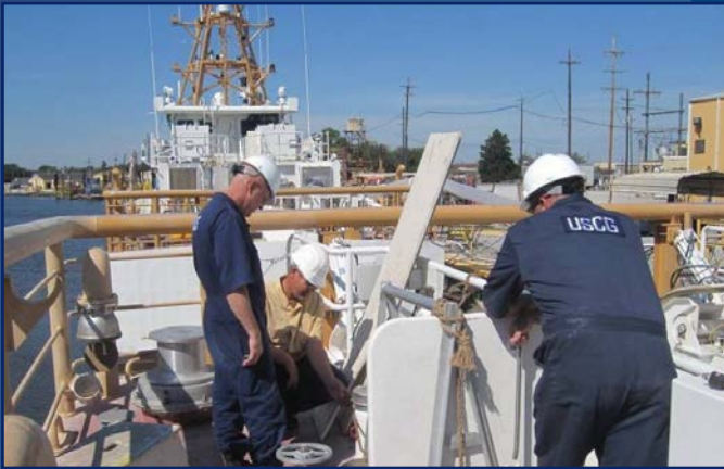
Coast Guard engineers from the Project Resident Office assess the shipbuilder's progress in constructing a Fast Response Cutter hull at Bollinger Shipyards in Lockport, La.

drawings, calculations, technical manuals, supply support and training. All of these efforts ensure that new FRCs are delivered to the Coast Guard according to contract specifications.