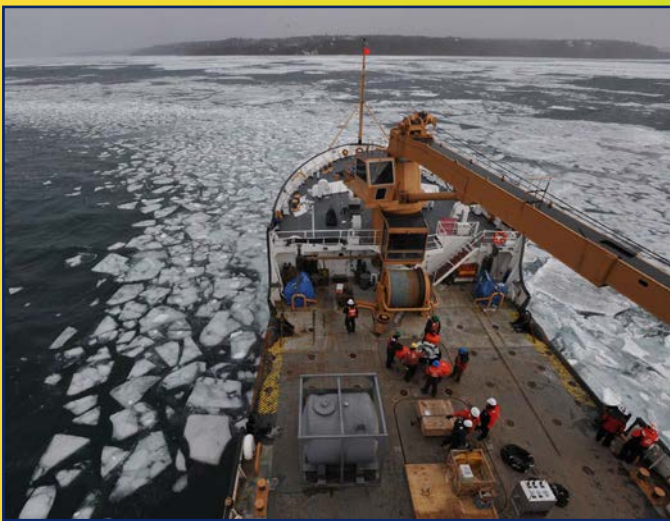
Coast Guard Cutter Hollyhock from Port Huron, Mich., breaks ice near Mackinac Island to support the Research and Development Center's tests of techniques for removing oil from ice.

The helix skimmer is efficient at removing oil without taking up water and ice with it. The Coast Guard also showed that existing fire boom technology could successfully move a section of ice away from a larger patch to burn any oil contained in it.