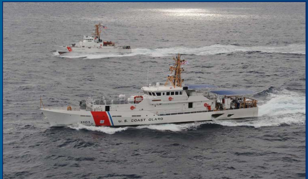
The Coast Guard Cutter Nantucket, a legacy 110-foot patrol boat, keeps pace with the Coast Guard's newest Fast Response Cutter, the Bernard C. Webber, during its arrival at Sector Miami on Feb. 9.

Bollinger Shipyards of Lockport is building the 154-foot Sentinel-class FRC to replace the 110-foot