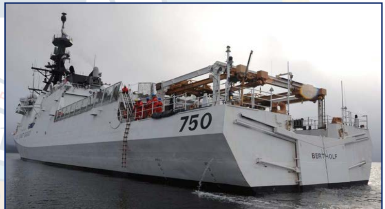
The Coast Guard Cutter Bertholf's name is visible on the stern as the crew prepares to navigate the ship through the Gastineau Channel prior to mooring at Juneau, Alaska, in April 2011.

Naming new cutters is a responsibility that the Coast Guard takes very seriously and decisions are not made quickly, nor without great thought and consideration. If you have a recommendation, I highly suggest you provide as much detail as possible in your proposal to assist the board and the Historian's Office in researching your suggestion.